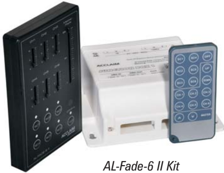
AL-Fade-6 II Kit

We wish to express our gratitude for you purchasing our digital product AL-Fade-6 II. You now hold a premiere, hybrid 6-ch DMX controller combining with 6 channel faders. Its compact and portable design is convenient to mount and easy to operate for users. Its key features consist of as the following: