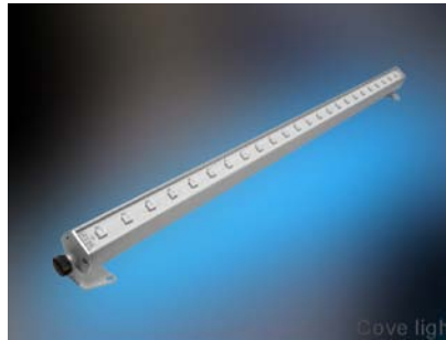
Compact profile design, plug and play. Easy to install.